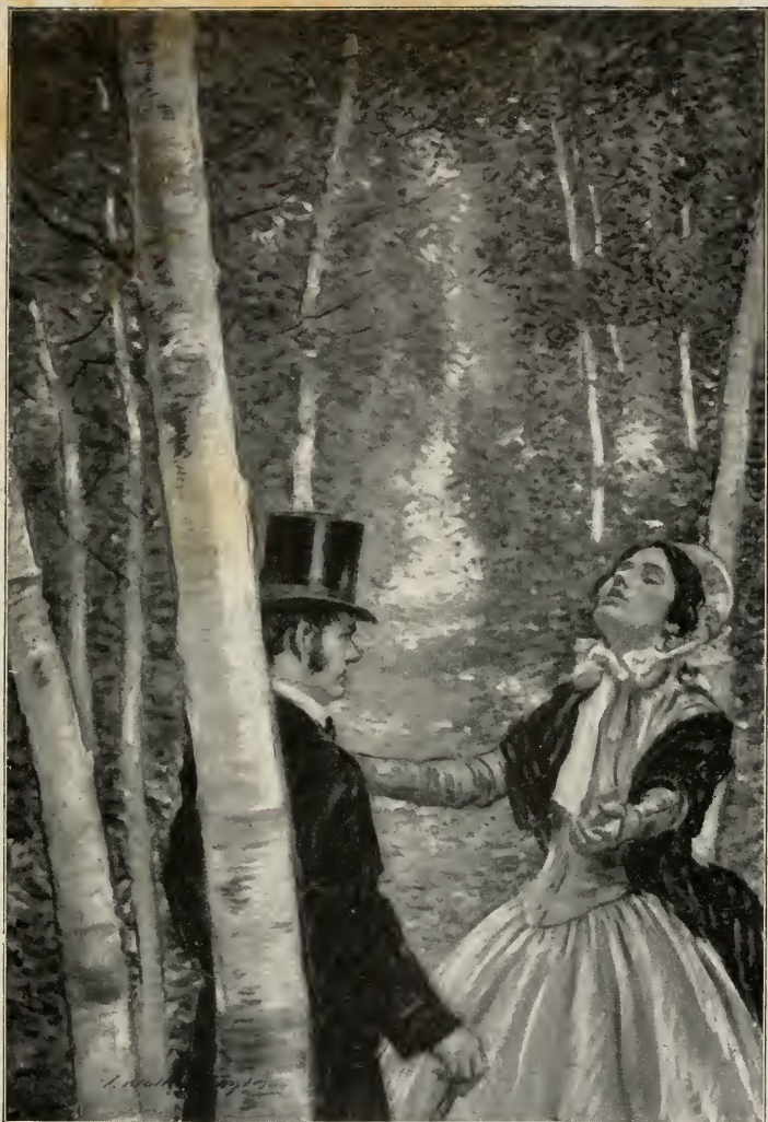
THE SUGGESTION OF THOSE GIVING HANDS WAS INESCAPABLE